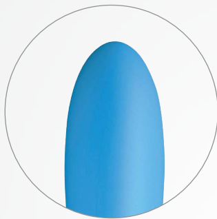
SILKY SMOOTH TEXTURE WARMS UP FOR NATURAL FEEL