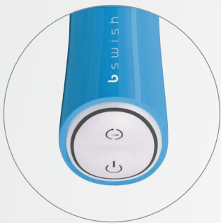
EASY TO CONTROL & RED BACKLIGHT