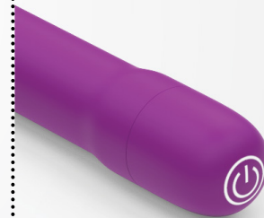
SIMPLE BACKLIT PUSH-BUTTON

The 5-functions are cycled through the click of a single button, which is lit up by a white light for easy play in the dark.